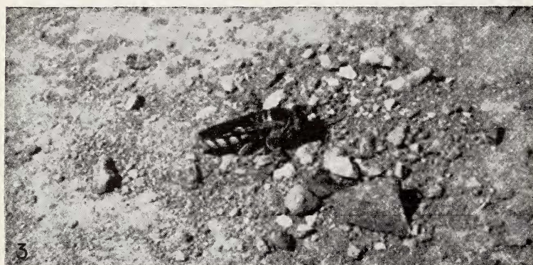
Figs. 1-3. Rubrica surinamensis females nesting in a hard-packed gravel road near Cali, Colombia. (1) Digging the nest. (2) Entering the nest through the entrance pile, carrying a paralyzed fly beneath the abdomen. (3) Resting on the entrance pile during an inactive period.